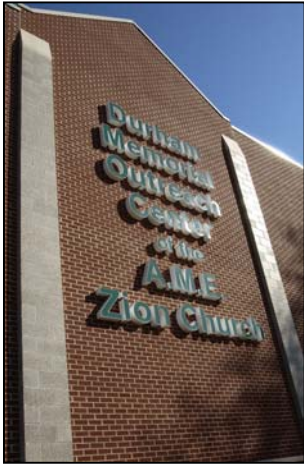
Community Outreach Center for Operation H.O.P.E. (Helping Our People Excel)

Durham Memorial's much needed Community Outreach Center was completed recently by P.A.T. Construction Management , the Construction Management arm of Casilio Companies.