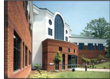
Erie and Niagara Insurance Association - Sheridan Drive, Clarence, New York

P.A.T. Construction Management is proud of its affiliation and friendship with the management group of Erie and Niagara.