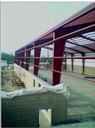
St. Mary's High School project in progress